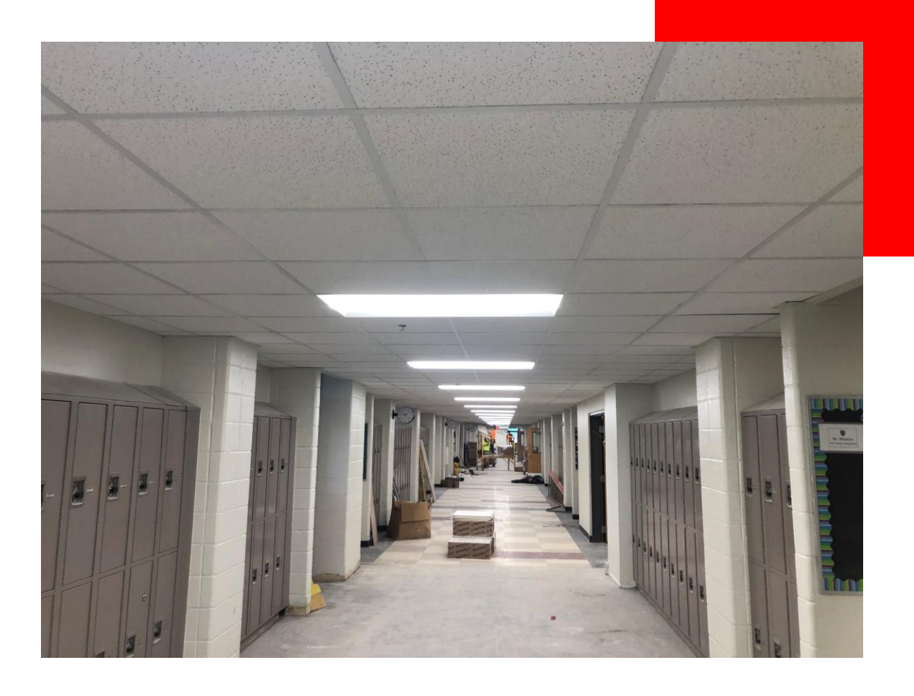
Charles Allen Building 4<sup>th</sup> Floor Progress