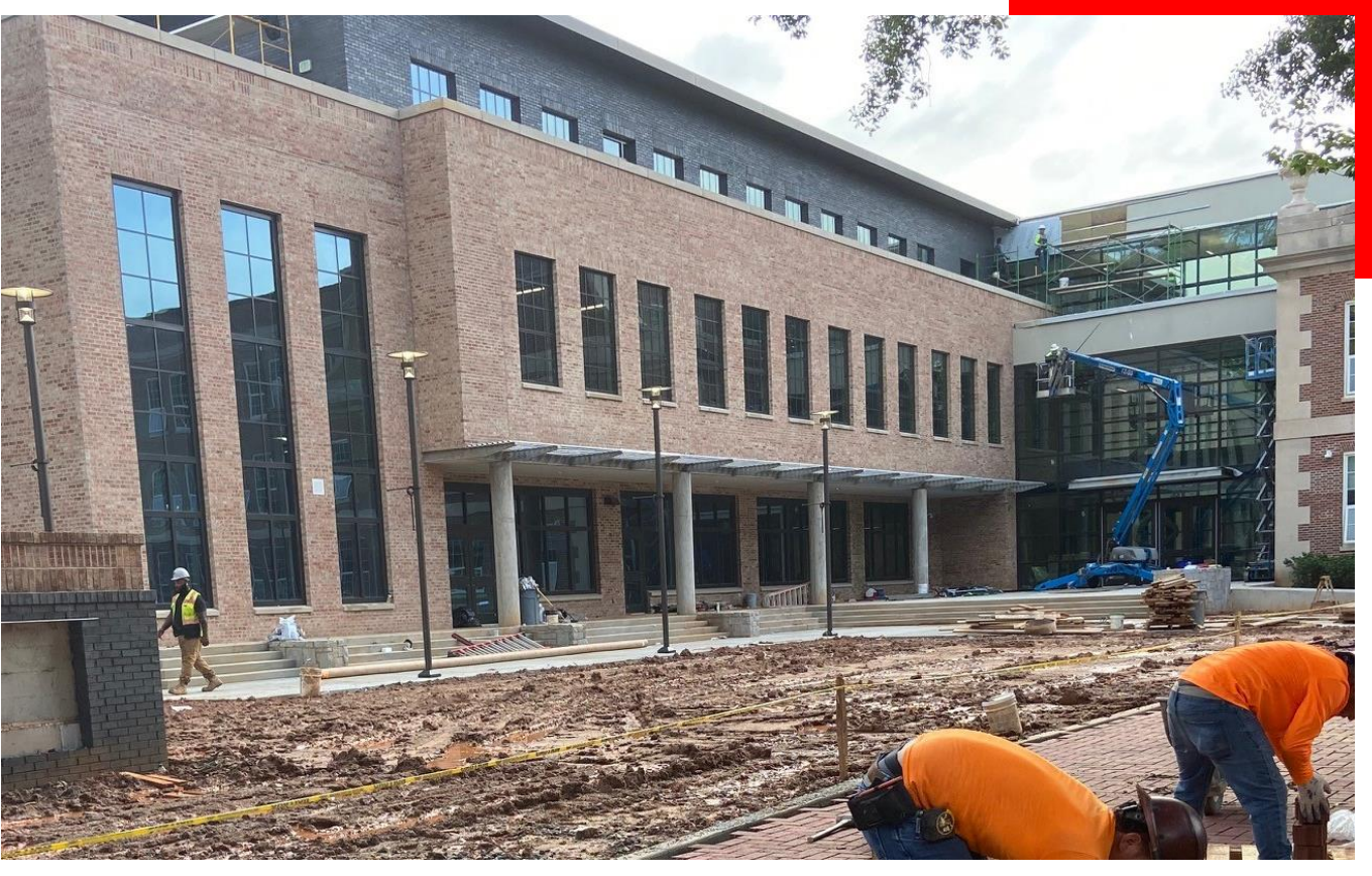
Front Campus Progress